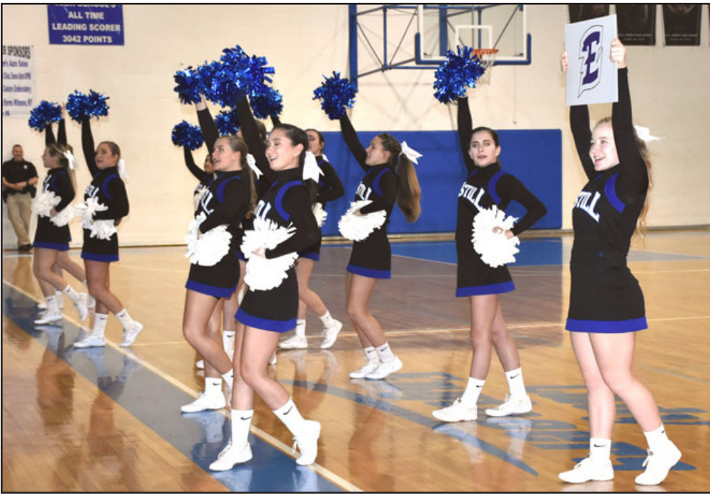
Estill cheerleaders cheer on the Engineers against Pulaski