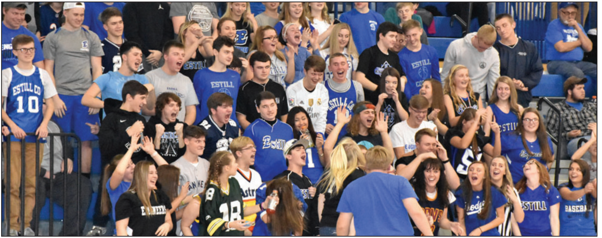
Estill Engineers fans had a good time on Monday night during the Engineers win over the Powell County Pirates.