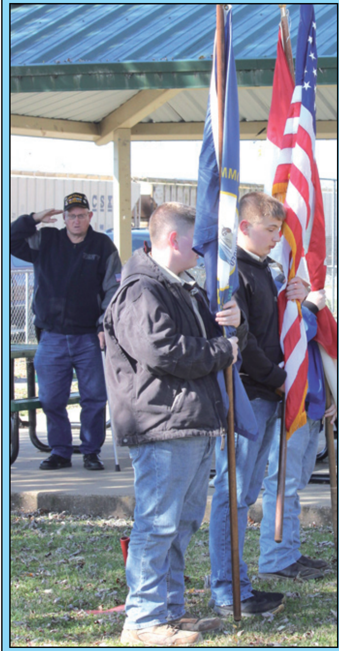
Veterans Day is now 100 years old. It began as Armistice Day at the end of WWI. Boy Scouts presented colors during Saturday's Veteran's Day ceremony at Veterans Memorial Park in Ravenna as a veteran in the background saluted the flag.

project at over $2.6 million. The library has $1.9 million earmarked for the project.