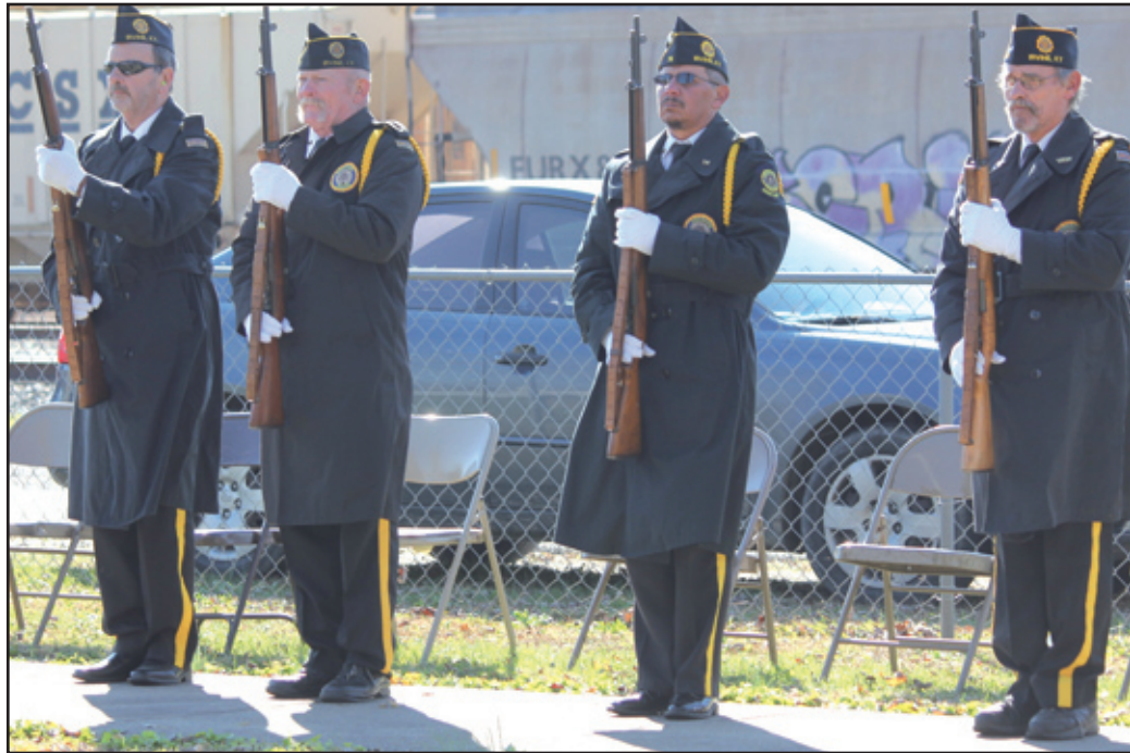
American Legion Post 79 Honor Guard performed a 21-gun salute during the veterans' ceremony.