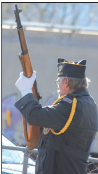
A member of the American Legion Honor Guard prepares to perform a 21-gun salute during Saturday's ceremony to honor veterans. The local Honor Guard performs the salute at the funerals of veterans. Like other Honor Guards in the area, the local group is having trouble keeping enough members. If you are a veteran and are interested, please see a member at the American Legion.