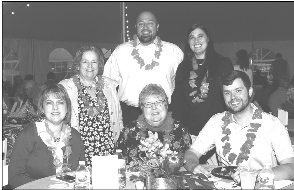
Citizens Guaranty Bank was the presenting sponsor of the Golf Scramble and Paradise Luau to benefit Marcum and Wallace Hospital.