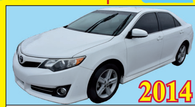
2014 TOYOTA CAMRY LE 4-DOOR! LOADED! LOCAL TRADE! FINANCING AVAILABLE!