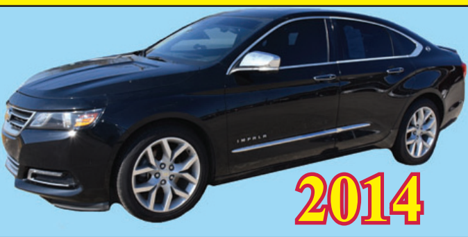
2014 CHEVROLET IMPALA LTZ 4-DOOR! LEATHER! MOON ROOF! LOW MILEAGE! ONE SHARP CAR! LOADED! LOW MILES!