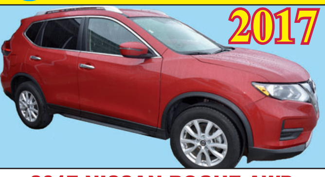
2017 NISSAN ROGUE AWD 4-DOOR! ALL WHEEL DRIVE! AUTOMATIC! LOADED! LOW MILES! FINANCING AVAILABLE!