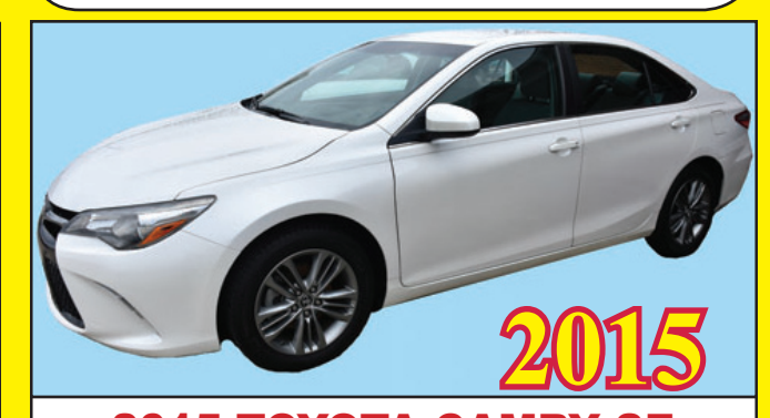
2015 TOYOTA CAMRY SE 4-DOOR! ONLY 15,000 MILES! LOADED! FACTORY WARRANTY! WE HAVE FINANCING!