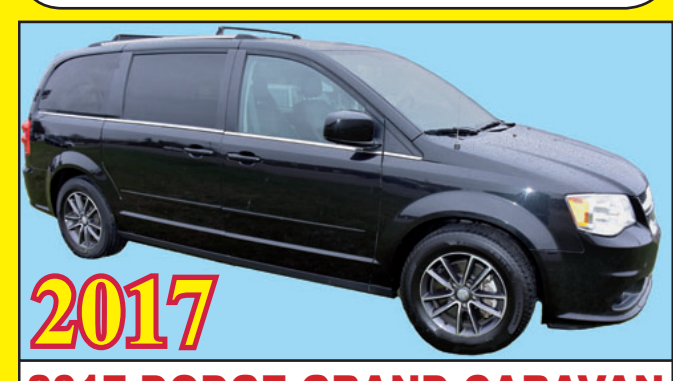
2017 DODGE GRAND CARAVAN SXT! LEATHER! LOW MILES! FACTORY WARRANTY! WE HAVE FINANCING!