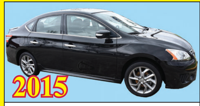
2015 NISSAN SENTRA SR 4-DOOR! LEATHER! MOON ROOF! LOW MILES! LOADED! FACTORY WARRANTY! FINANCING!