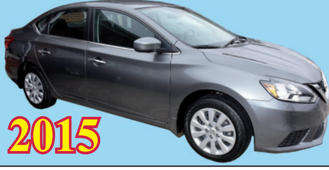
2015 NISSAN ALTIMA 4-DOOR! LOADED! LOW MILES! WE HAVE FINANCING!