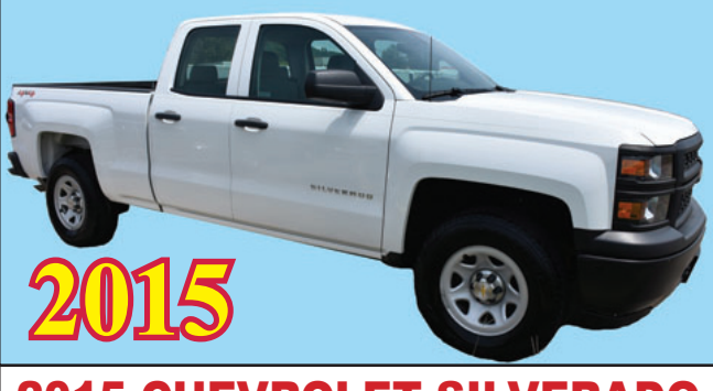
2015 CHEVROLET SILVERADO 4-DOOR, 4X4, 5.3 V8, AUTOMATIC, PW, PLKS