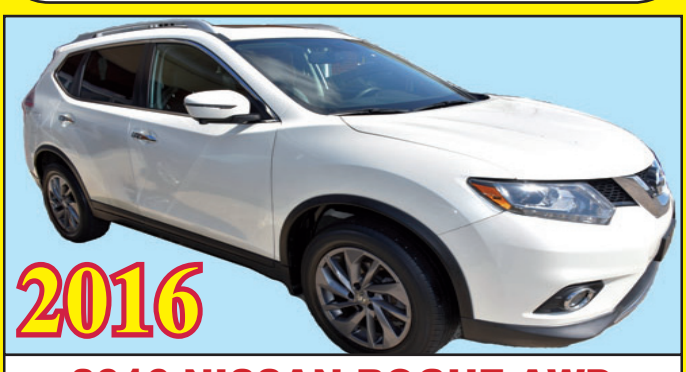
2016 NISSAN ROGUE AWD LEATHER! MOON ROOF! ONLY 18,000 MILES! FACTORY WARRANTY! WE HAVE FINANCING!