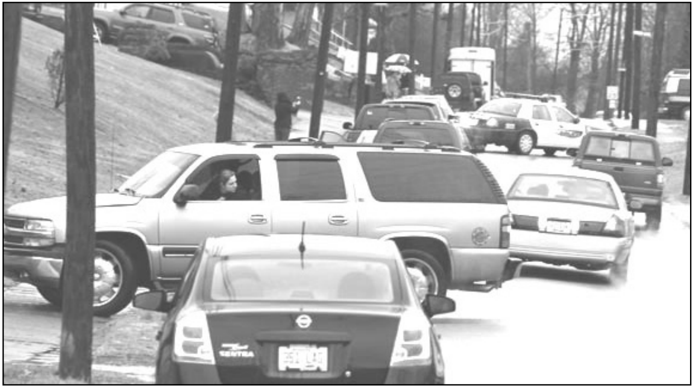
Through traffic was blocked on Broadway during Saturday's "stand-off" on Hood Avenue. The home of the deceased was near the Broadway intersection.

He also entered not-guilty pleas to flagrant non support on Feb. 16. Preliminary hearings on those charges will be held Feb. 21.