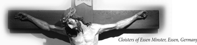
Cloisters of Essen Minster, Essen, Germany

When you were dead in your transgressions and the uncircumcision of your flesh, He made you alive together with Him, having forgiven us all our transgressions, having canceled out the certificate of debt consisting of decrees against us, which was hostile to us; and He has taken it out of the way, having nailed it to the cross. COLOSSIANS 2:13,14