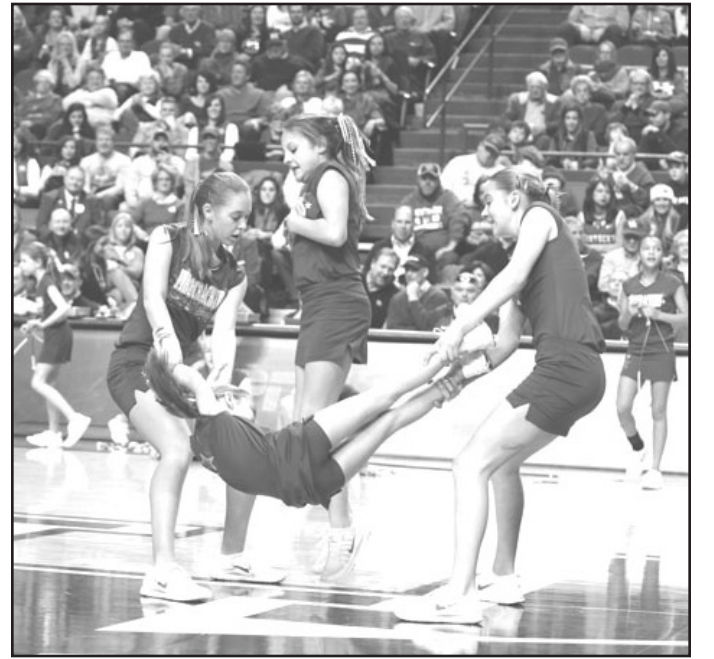
The Firecrackers will be back in Rupp Arena Feb. 17 when UK hosts Alabama.