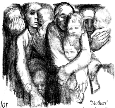
"Mothers" by Käthe Kollwitz (1919)

If a brother or sister is without clothing and in need of daily food, and one of you says to them, "Go in peace, be warmed and be filled," and yet you do not give them what is necessary for their body, what use is that? JAMES 2:15,16