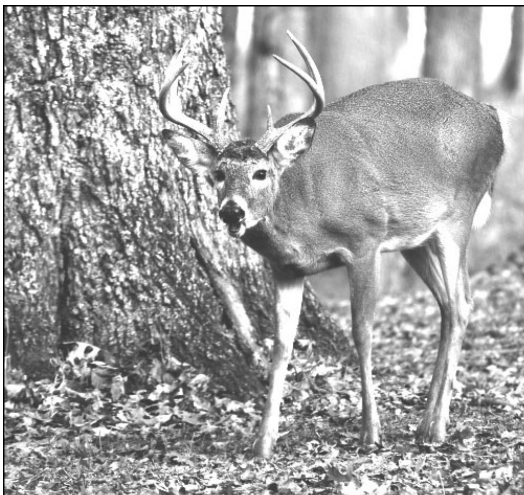
A Kentucky buck keeps a watchful eye while feeding on mast.

Hunters donated almost 1,000 deer in 2017, translating to almost 40,000 pounds of ground venison and up to 300,000 meals provided in soups, stews and sauces for Kentucky families. Kentucky Hunters for the Hungry hopes to double the number of deer donated to the program.