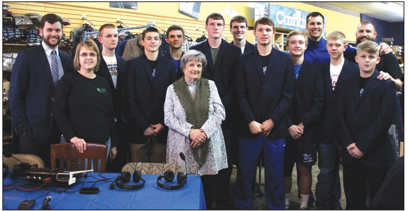
The 14th Region Basketball Champ Estill County Engineers show off their team blazers that were donated by Citizens Guaranty Bank to be worn at the 2018 Kentucky "Sweet 16" basketball tournament.