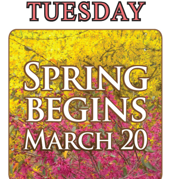
© 2017 by King Features Syndicate, Inc