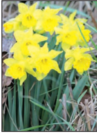
The daffodils started blooming during the warm weather of February. They announce the coming of spring, which is next Tuesday.