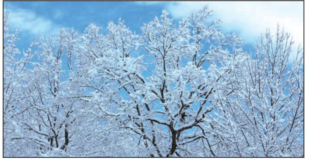
About eight inches of a wet snow fell on Estill County overnight on Sunday. The snow covered trees and power lines, causing downed trees and numerous power outages.