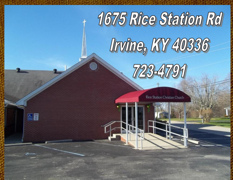
1675 Rice Station Rd Irvine, KY 40336 723-4791