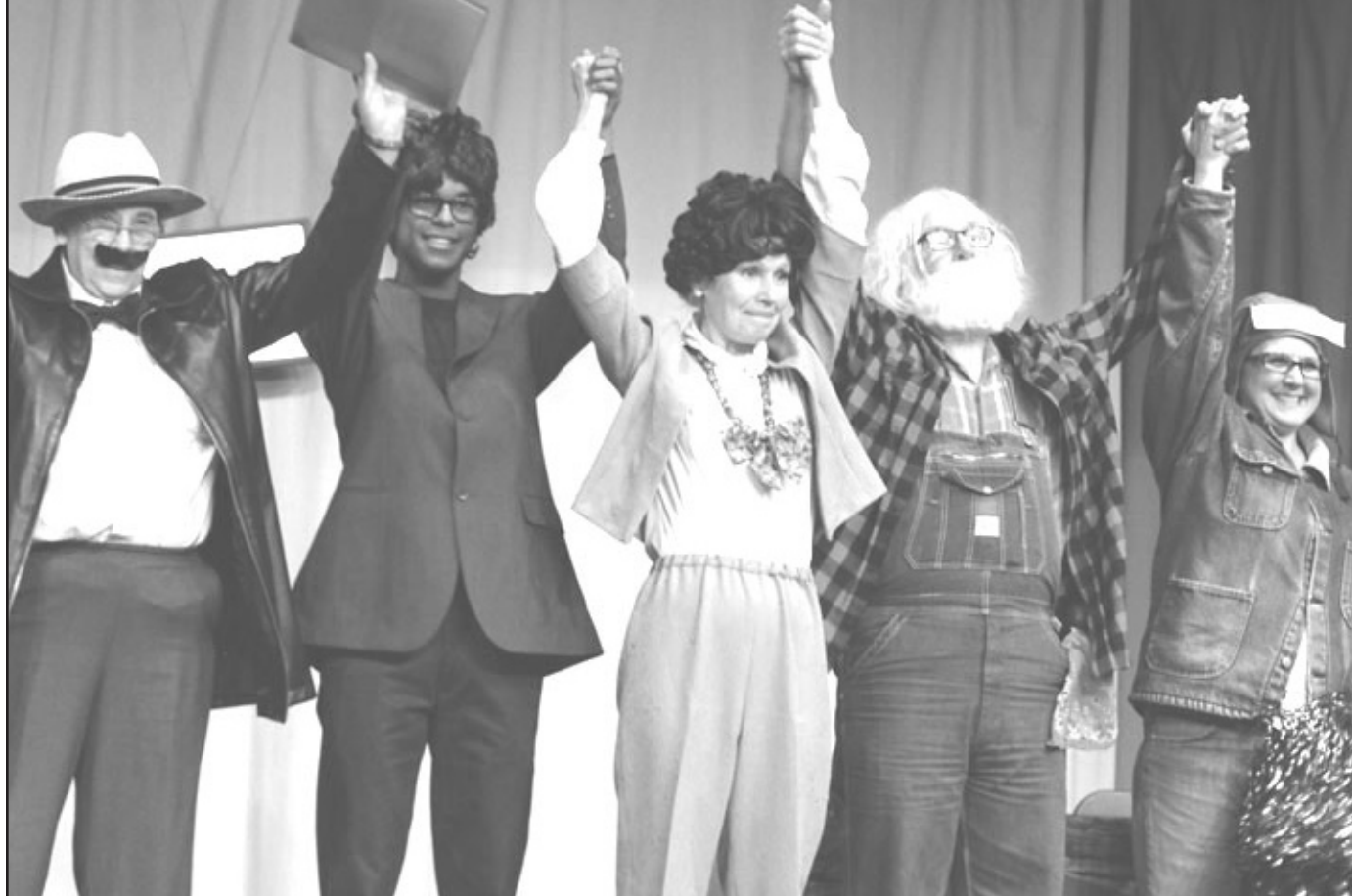
The cast of "Greater Tuna" saluted Sunday afternoon following their performance at the high school auditorium. The production was a venture of River City Players.