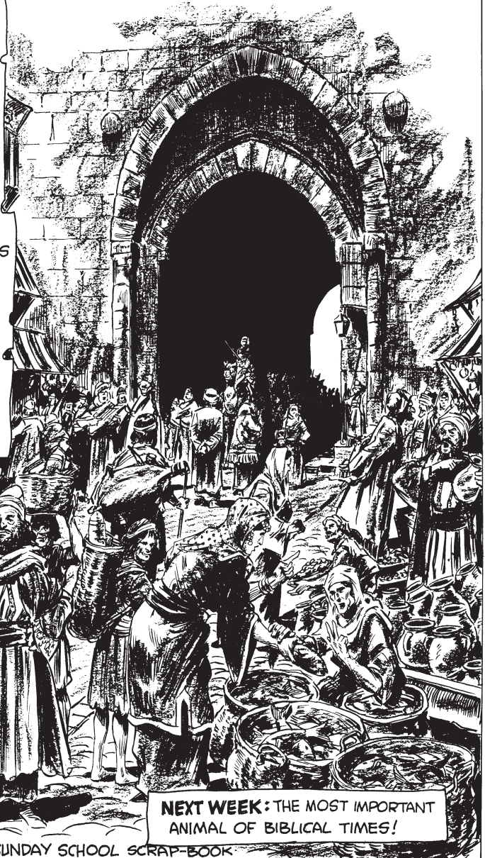
NEXT WEEK: THE MOST IMPORTANT ANIMAL OF BIBLICAL TIMES!

... THE BIBLICAL MARKETPLACE WAS ANOTHER MATTER. A CITY'S GATEWAY OPENED INTO A KIND OF PLAZA—HERE WAS THE MARKET, WHERE EVERY KIND OF TRADING AND SELLING TOOK PLACE. AN ANCIENT SAYING DECLARED, "ONE CAN BUY ANYTHING IN THE MARKETS OF JERUSALEM, FROM A FINE CAMEL TO A FALSE TOOTH!" AND YOU WOULD MEET THE MAN WHO RAISED THE MEAT YOU BOUGHT, OR THE GRAIN YOU WANTED FOR A FINE FLOUR—THE SHEEP-RAISER, THE OLIVE OIL-MAKER, THE FARMER, THE POTTER, THE CLOTH-SPINNER, WERE HERE TO PERSONALLY SELL YOU THEIR OWN GOODS. PEOPLE OF MANY NATIONS THROUGED JERUSALEM'S MARKETS—A DOZEN LANGUAGES MIGHT BE HEARD WITHOUT TAKING MORE THAN A FEW STEPS—A CONSTANT DIN OF VOICES, CRYING THE VIRTUES OF THIS MELON, THAT PERFUME, AGAINST A BACKGROUND OF THE CLINK AND JINGLE OF THE MONEY CHANGERS, WITHOUT WHOM THE BUYING AND SELLING OF ALL THESE GOODS COULD HARDLY BE MANAGED. A POLYGLOT OF ACTIVITY, WAS THE ANCIENT MARKETPLACE WHEN "GOING TO MARKET" WAS AN EXCITING EVENT, INDEED!