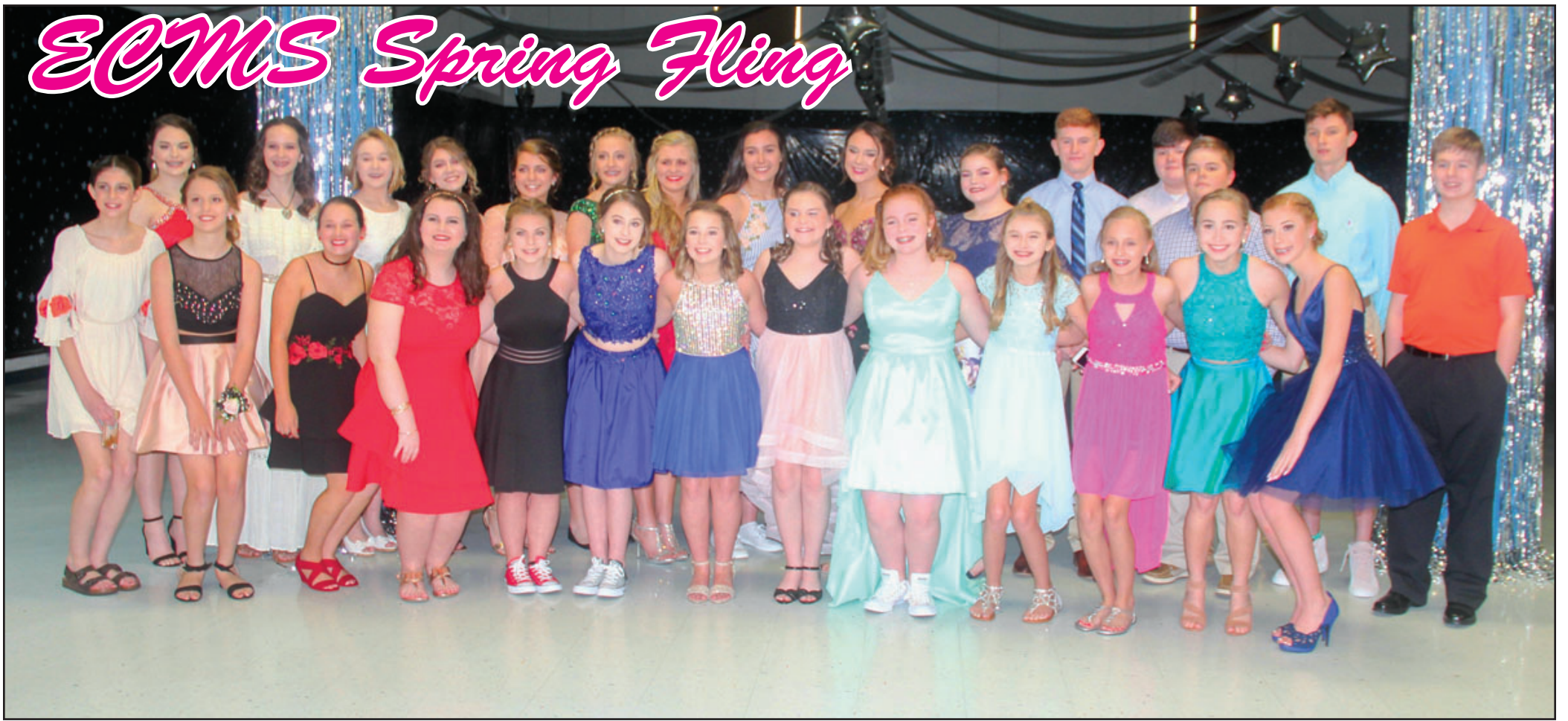
Members of the student council at the Estill County Middle School hosted the annual Spring Fling on Friday night.