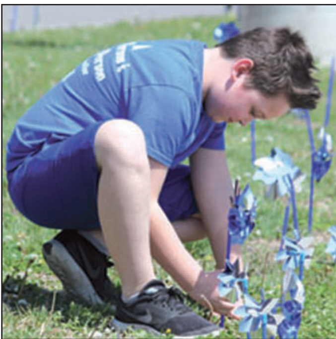
Above, a student places a pinwheel on the front lawn of West Irvine Intermediate as observance of child abuse prevention month. Right photo: The ground was hard causing students to get in all kinds of positions to plant their pinwheels.