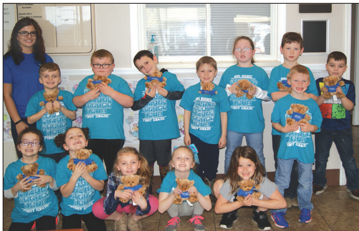
Students from Estill Springs Elementary participated in the Marcum & Wallace Hospital Teddy Bear Fair on Tuesday, March 27th. Each year, first grade students from Estill, Lee, Powell and Owsley counties visit the hospital to receive education about injury prevention and good health. It allows the students to become familiar with the facility, making a visit to the hospital less frightening. Each student that attended the Teddy