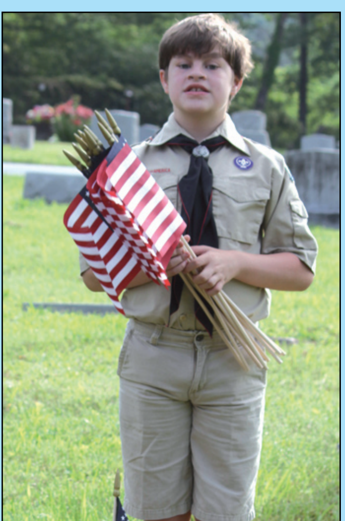
graves. The Girl Scouts also helped.