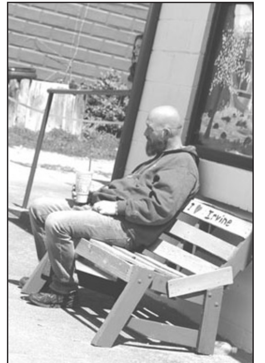
Someone found a seat on the bench during the festival which says, "I (heart) Irvine, Ky."