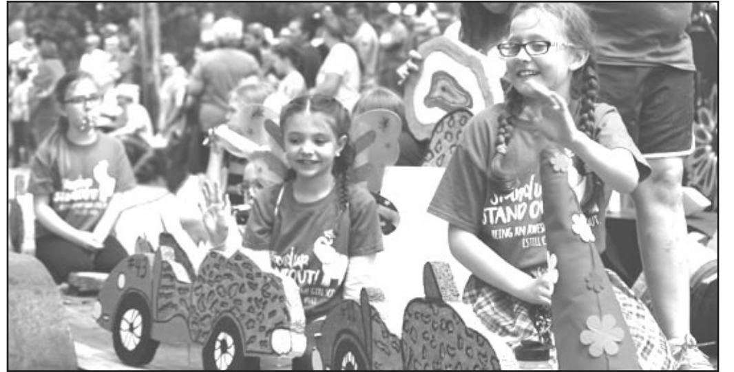
Estill County Girl Scouts rode a float through the parade route. It was decorated with "fungus" shaped cars.