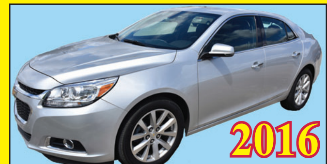
2016 CHEVROLET MALIBU LTZ 4-DOOR! LOADED! LEATHER! LIKE NEW! FACTORY WARRANTY! WE HAVE FINANCING!

2016 CHR. TOWN & COUNTRY LEATHER! DVD! LOADED! ONLY 16,000 MILES! FACTORY WARRANTY! WE HAVE FINANCING!