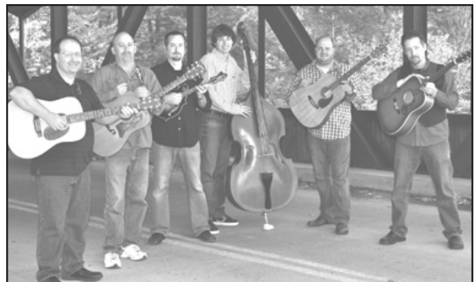
New Harvest Brothers

House of Prayer, 535 Dark Hollow Road in Irvine, will be having a Gospel Singing this coming Saturday, May 12, 2018, at 6:00 p.m. featuring the New Harvest Brothers from Virginia, along with the local Praise Singers. Everyone welcome. There will be refreshments afterwards.