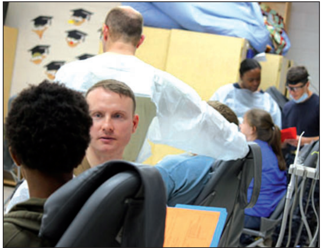
A row of dentists (in white jackets covering military uniforms) perform dental work on patients using portable equipment at Lee County High School on Monday morning.