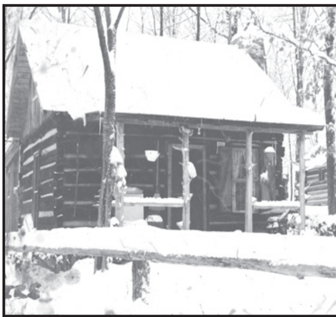
LOG CABIN FOR SALE One-room log cabin with 8+ acres at Furnace Junction. Also has log outbuilding. Reduced. Call (859) 404-7681.