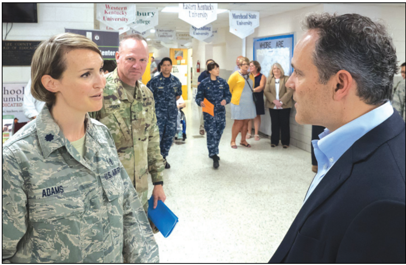
Gov. Matt Bevin visited with the KY Air National Guard on Saturday during Operation Bobcat. The operation provided free medical, dental, and vision care to 2,662 patients between June 15-24 with an estimated value in excess of $1 million. There were four teams working at Estill, Lee, Breathitt, and Owsley County High Schools. The operation provided over 13,000 hours of training for the military.