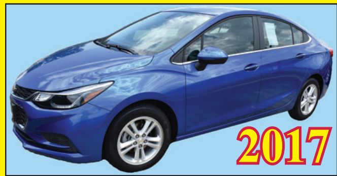
2017 CHEVROLET CRUZE LT MOONROOF! NAVAGATION! ONLY 16,000 MILES! LIKE NEW! FACTORY WARRANTY! FINANCING!