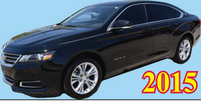
2015 CHEVROLET IMPALA LT 4-DOOR! LEATHER! LOADED! ONLY 26,000 MILES! FACTORY WARRANTY! FINANCING AVAILABLE!