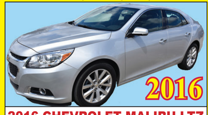
2016 CHEVROLET MALIBU LT2 4-DOOR! LOADED! LEATHER! LIKE NEW! FACTORY WARRANTY! WE HAVE FINANCING!