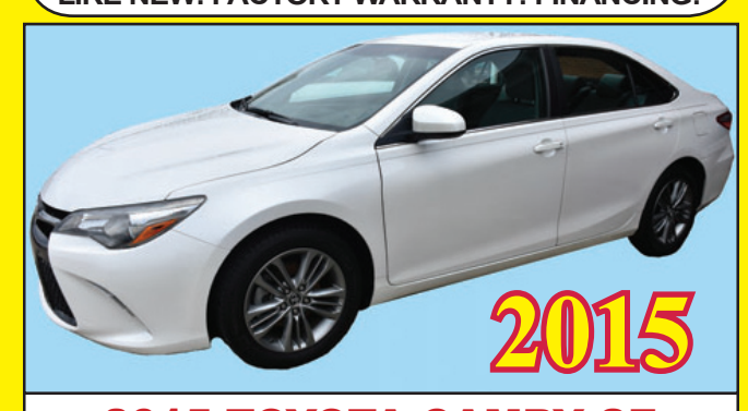
2015 TOYOTA CAMRY SE 4-DOOR! ONLY 15,000 MILES! LOADED! FACTORY WARRANTY! WE HAVE FINANCING!