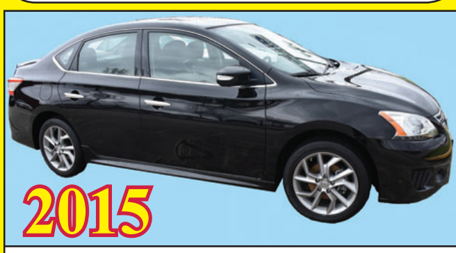
2015 NISSAN SENTRA SR 4-DOOR! LEATHER! MOON ROOF! LOW MILES! LOADED! FACTORY WARRANTY! FINANCING!