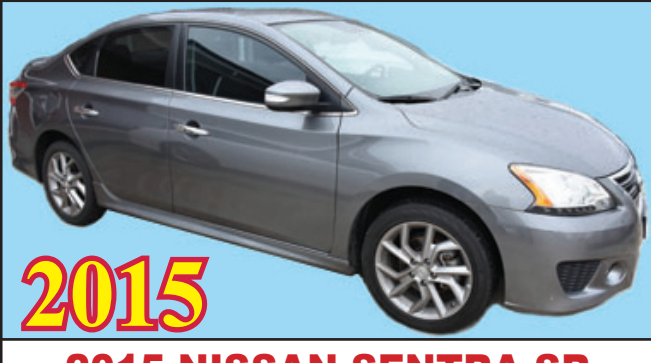
2015 NISSAN SENTRA SR 4-DOOR! LOADED! ONE-OWNER! LOW MILES! FACTORY WARRANTY! WE HAVE FINANCING!