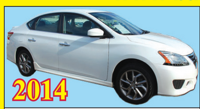
2014 NISSAN SENTRA SR 4-DOOR! LOADED! LOW MILES! FACTORY WARRANTY! WE HAVE FINANCING!