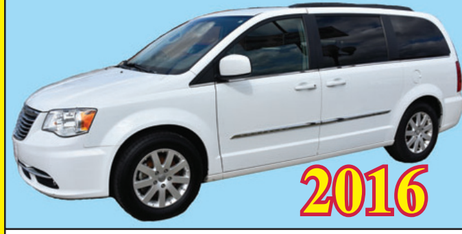
2016 CHR. TOWN & COUNTRY LEATHER! DVD! LOADED! ONLY 16,000 MILES! FACTORY WARRANTY! WE HAVE FINANCING!