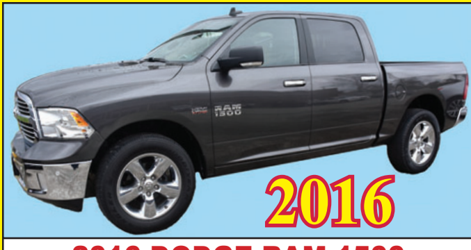
2016 DODGE RAM 1500 4-DOOR CREW CAB! 4X4 5.7 ENGINE! LOW MILES! ONE-OWNER! WE HAVE FINANCING!