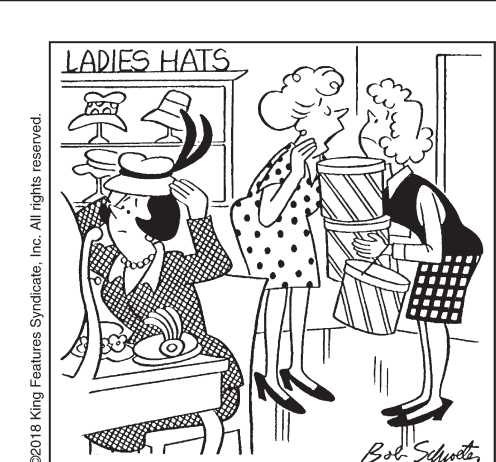
"And if you expect to hold onto this job, don't go giving them honest