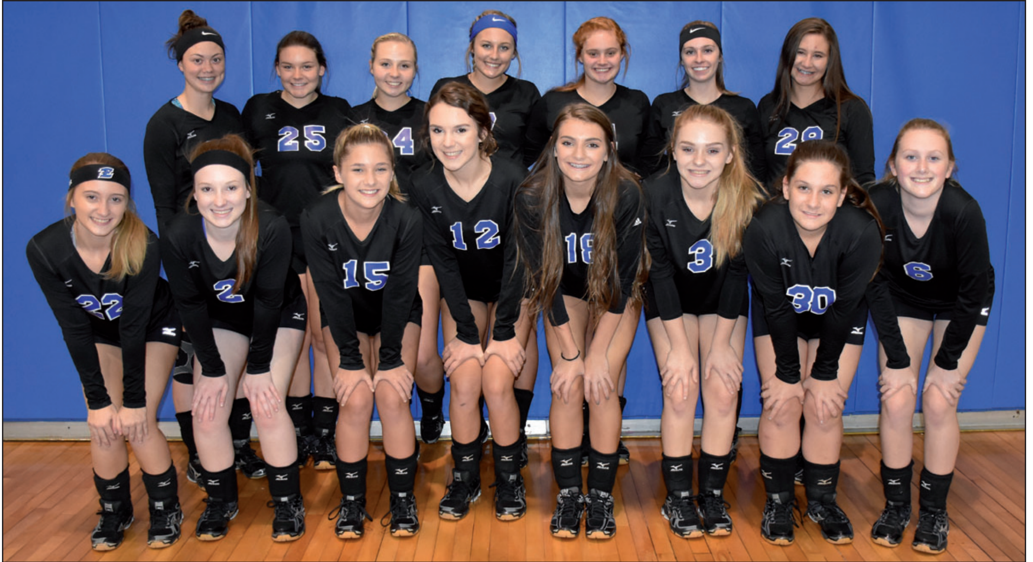
2018 ESTILL COUNTY LADY ENGINEERS VOLLEYBALL

KHEAA also disburses Advantage Education Loans, the state's only non-profit private education loan. For more information, visit www.advantageeducationloan.com .