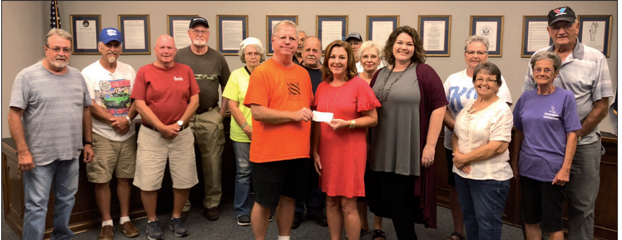
Kruzers present check to Hospice Care Plus