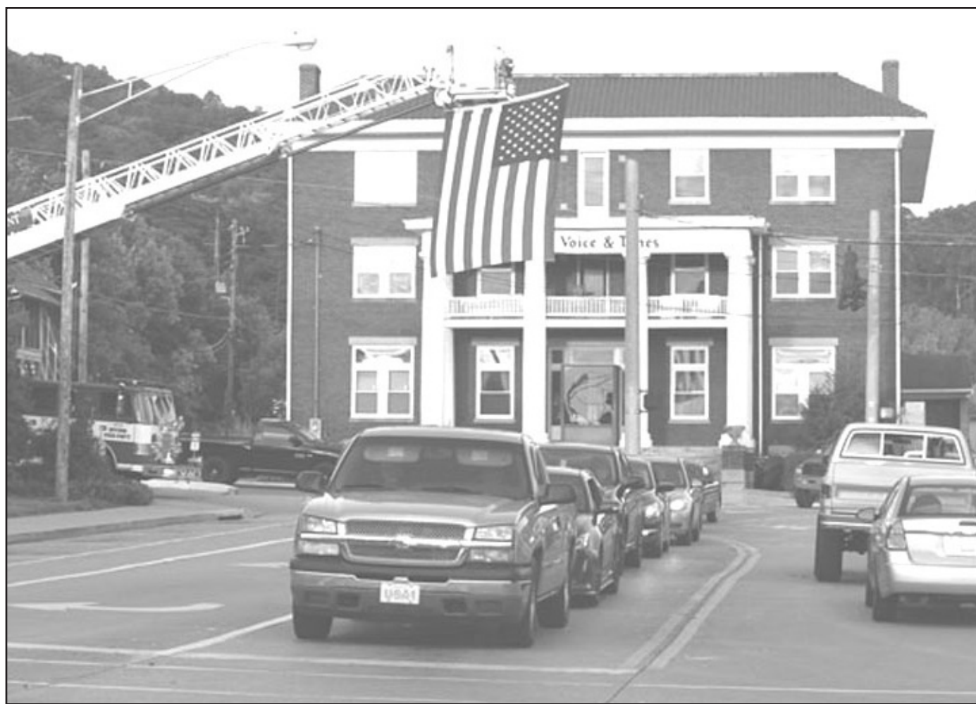
The Irvine Fire Department used their ladder truck Saturday evening to hang a large American flag. Vehicles traveling River Drive near Main Street were able to pass under the flag in observance of Labor Day. Most vehicles participating in the drive turned right onto Court Street and went around the block before heading back toward Ravenna. Like the police, Irvine's firemen made a presence on Saturday night.