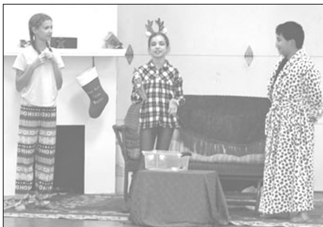
Young actors with River City Players performed several skits on Saturday. The skits kept with the event's theme, "Christmas in the Park." However, due to rainy weather, it was moved to the fair barn for the second straight year.