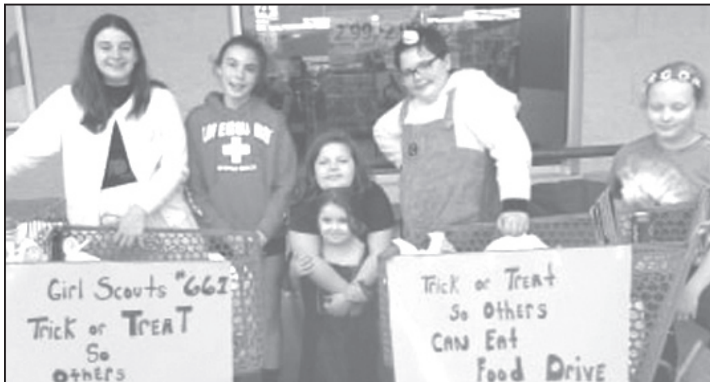
Girl Scout Troop 661 Daisies, Cadettes and Juniors spent the weekend on community service hours. They put on Halloween costumes to do a little Trick or Treating for canned goods at Save-A-Lot. Trick or Treat, so others can eat was the theme. They got enough donated food to fill two carts.