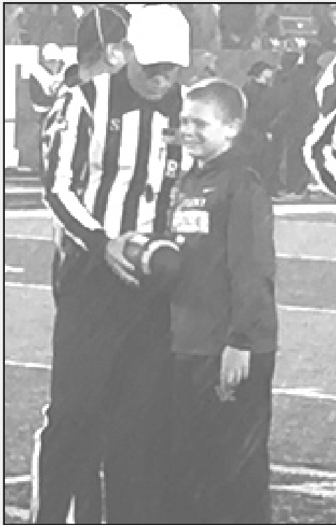
Colton delivers UK game ball