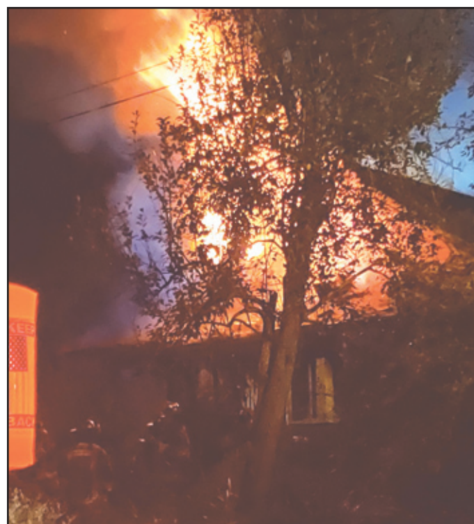
Four fire departments fought a fire on Covey Road last Tuesday night before finding a body on the second floor.