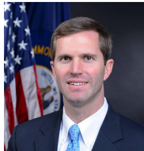
Andy Beshear (D-Louisville)