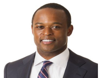
Daniel Cameron (R-Louisville)

The information below was compiled by voting records and a candidate questionnaire distributed by the Commonwealth Policy Center, a nonprofit, nonpartisan Kentucky organization.