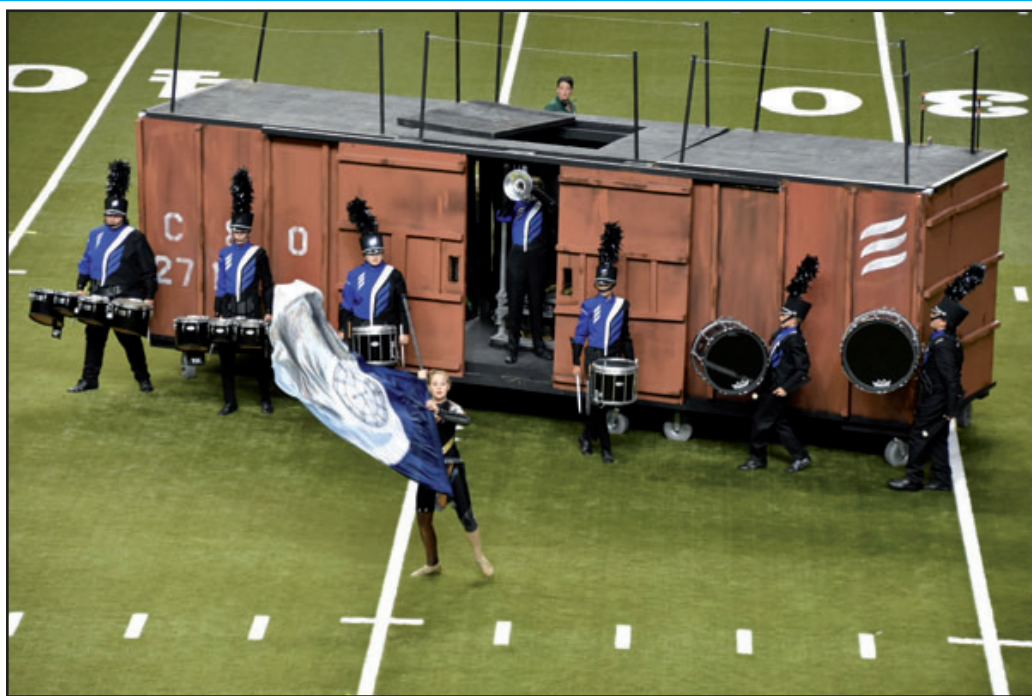
TOP LEFT and RIGHT: The Estill County Marching Engineers in some of their recent performances.