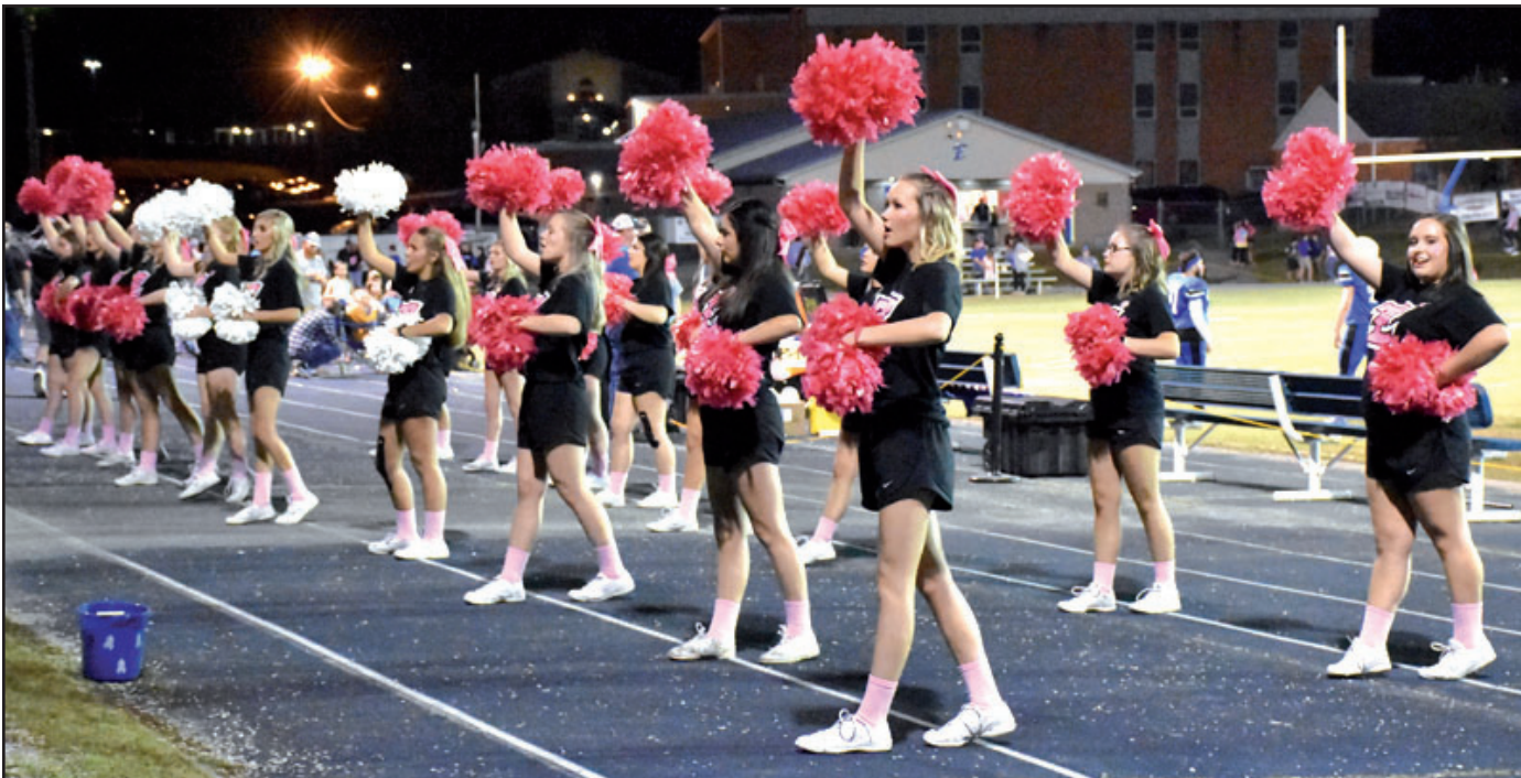
ABOVE, BELOW: The Estill County Engineers Cheerleaders collected money for cancer causes on Friday