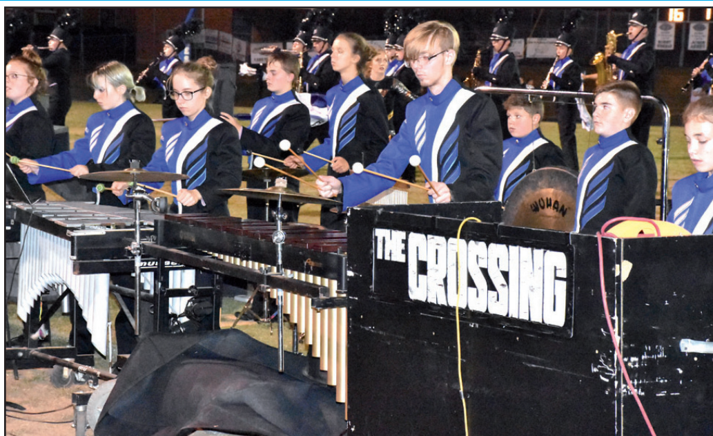
The Estill County Marching Engineers Band performed before the home game on Thursday, October 3, 2019, during halftime of the Estill-Jackson County game before traveling on Saturday to Madison Central's Parade of Bands in Richmond where they won their class and were named Grand Champion as well.