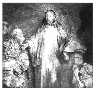
"Christ Preaching" by Rembrandt (1646-1650)