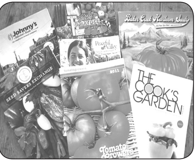
Seed catalogs are generally available free.

preparation for spring. This will set you up