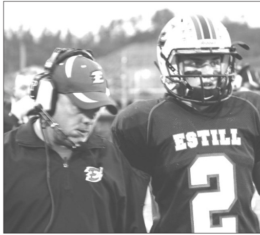
2014 3A Coach and Player of the Year