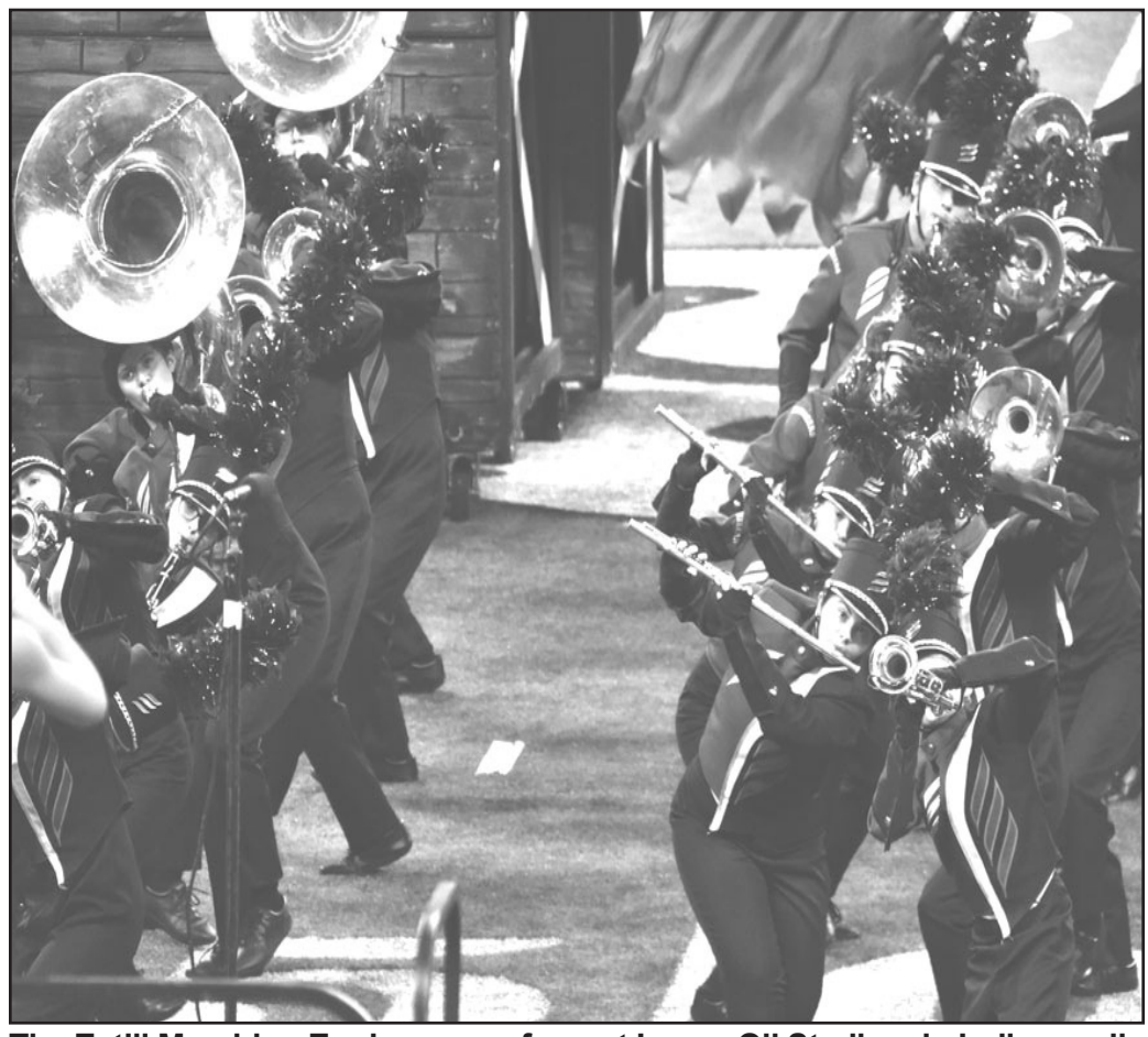
The Estill Marching Engineers perform at Lucas Oil Stadium in Indianapolis

The Marching Engineers competed in the KMEA State Marching Band Championships in Bowling Green. The band first performed in State Semifinals at Warren Central High School with the other 15 bands who advanced from Quarterfinals. After an extremely courageous performance through high winds, the band learned that they had the overall highest score of the 16 bands in Semifinals. This again earned them a spot in State Finals (the final four) which were held Saturday evening at WKU. Estill's finals performance was simply stunning. All of the countless hours of hard work finally paid off with a nearly flawless run, and a standing ovation from the entire stadium. But, by the narrowest of margins, the band was awarded 2nd place with a score of 88.9. Rival Adair County was named State Champions with a score of 89.0. This was Estill's 6th State Finals ap-