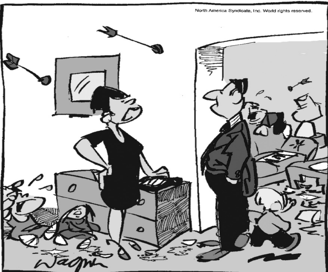
"I'm not sure I trust a baby sitter desperate enough to watch our kids."