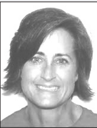
by Dawn Reed E. Ky. Columnist

Two black-speckled bananas are on my kitchen counter. If you stopped by the parsonage and saw them, you would probably suck in air through your