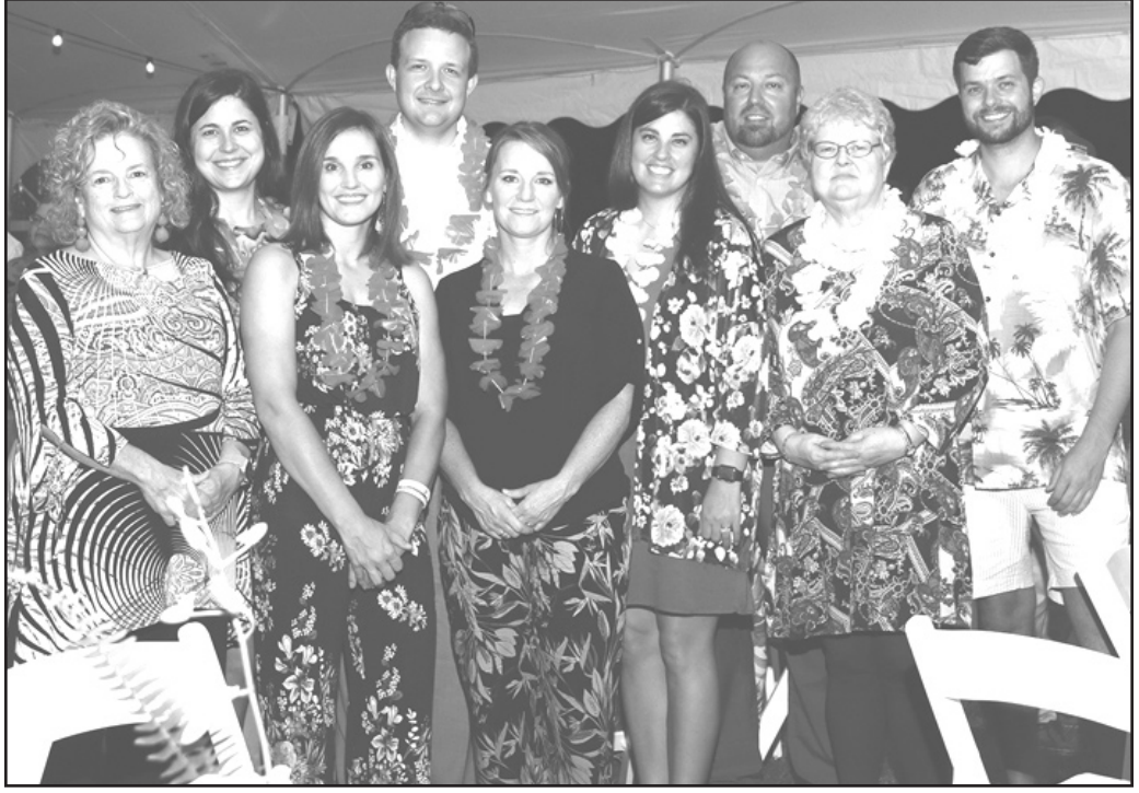
Citizens Guaranty Bank was the presenting sponsor of the 2019 Mercy Health Foundation Irvine Golf Scramble and Paradise Luau Dinner. Pictured are Citizens Guaranty Bank employees and guests at the luau.