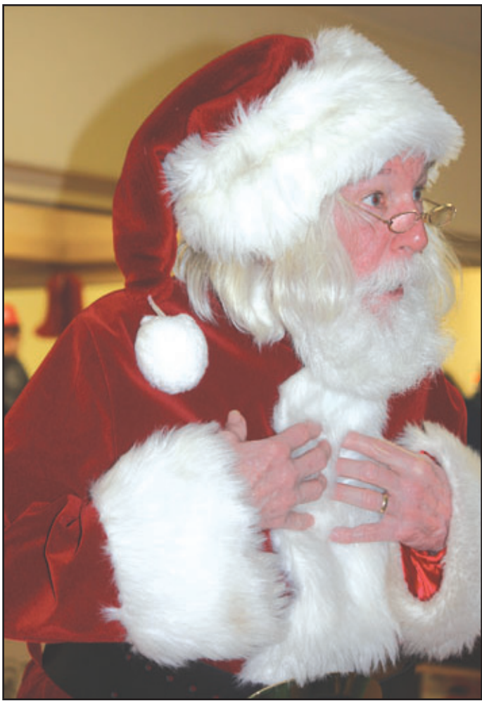
For the second straight weekend, Santa was in Irvine. He and Mrs. Claus were in the Kiwanis parade on Friday night and at the Elizabeth Witt Christmas party on Saturday.