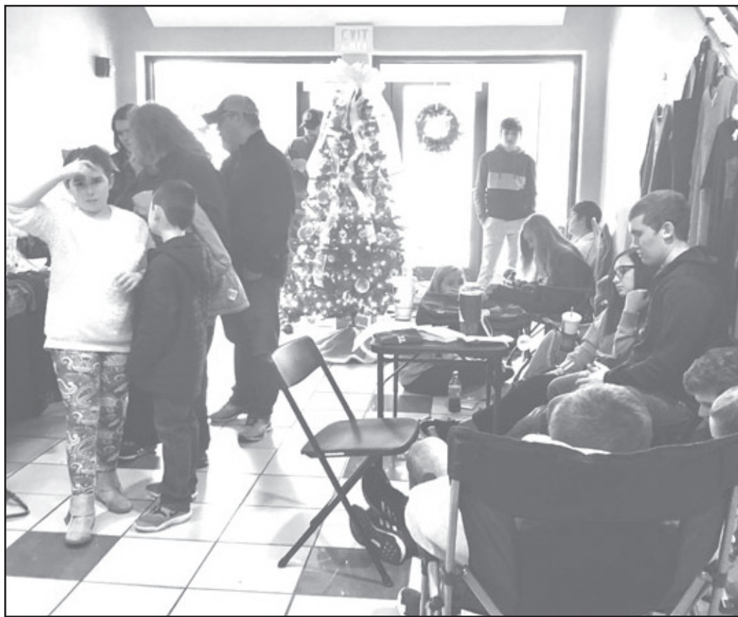
The courthouse was busy on Saturday morning as shoppers enjoyed the booths that were set up. The event is organized by members of the FBLA from the Estill County High School.