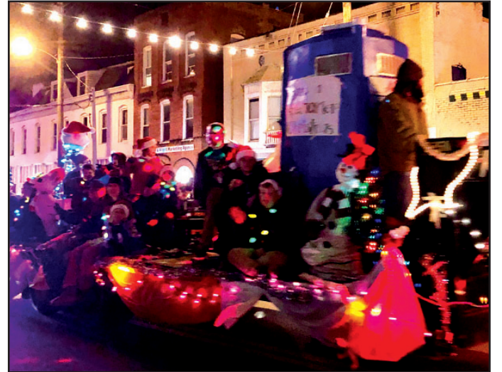
Estill Springs Elementary won first place during the Kiwanis Christmas parade for their "Spect-TACKLYler" float. They won $125. The Cub Scouts won $100. with second place, and Estill County Band Boosters got $75 for 3rd place.