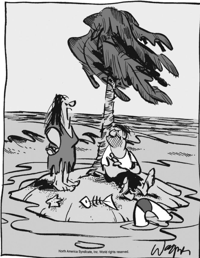
"Aren't you going to look for a Christmas tree?"