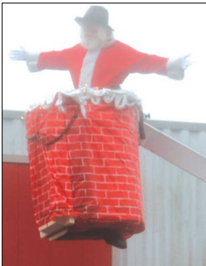
Santa Claus came down from the roof top in a bucket truck on Saturday morning. He will be at the Elizabeth Witt Christmas Party at Irvine First Christian Church this coming Saturday starting at 10 a.m.

See Page 2 for more information on these holiday events.