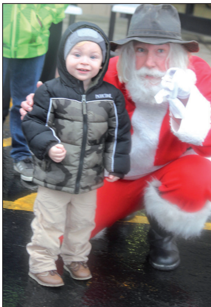
It was raining on Saturday when Santa Claus got down off the roof of Meade's Do-It Center in a bucket truck. Santa asked the children to wait inside while he got out of his rain soaked clothes. This little toddler insisted on seeking Santa in the rain.