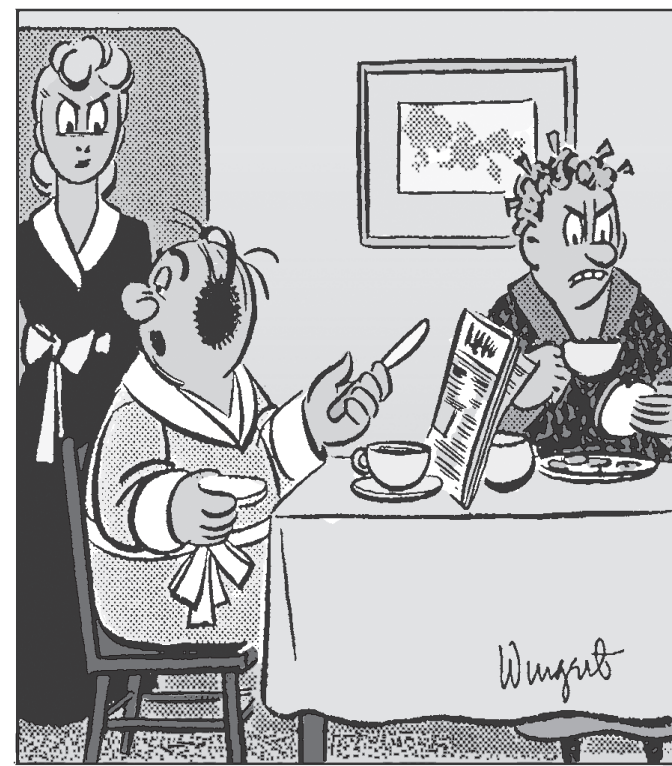
"After six months, I've heard just about everything she has to say."