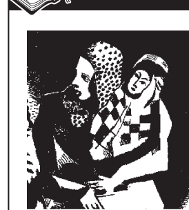
Detail of A Group of People by Marc Chagall, 1914

...from infancy you have known the holy Scriptures, which are able to make you wise for salvation through faith in Christ Jesus.