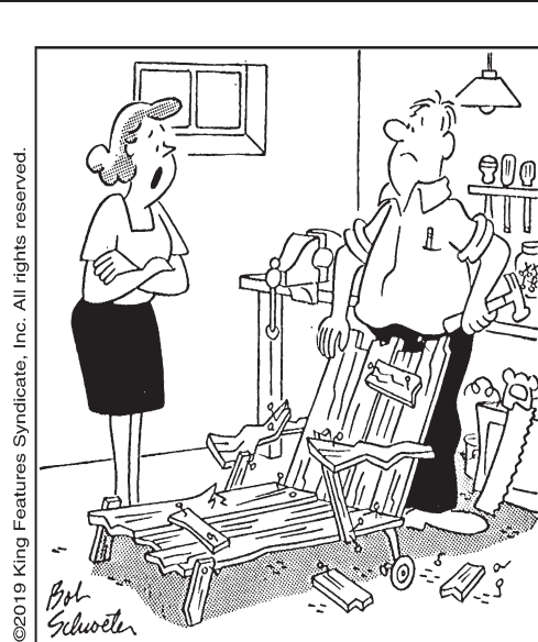
"If that's for the patio, I hope _____ never comes."

One man says to the other, "You know, there are really only three kinds of people in the world: those who can count, and those who can't."