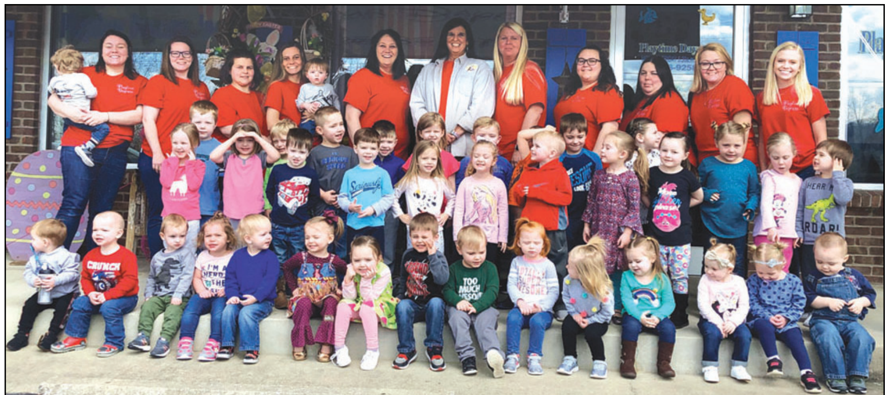
Staff and older children posed for a photograph in front of Playtime Day Care on Monday afternoon. The daycare center has been in business for 20 years and will have a celebration at the Estill County Fair Grounds on March 30. See more photos on Page 15.