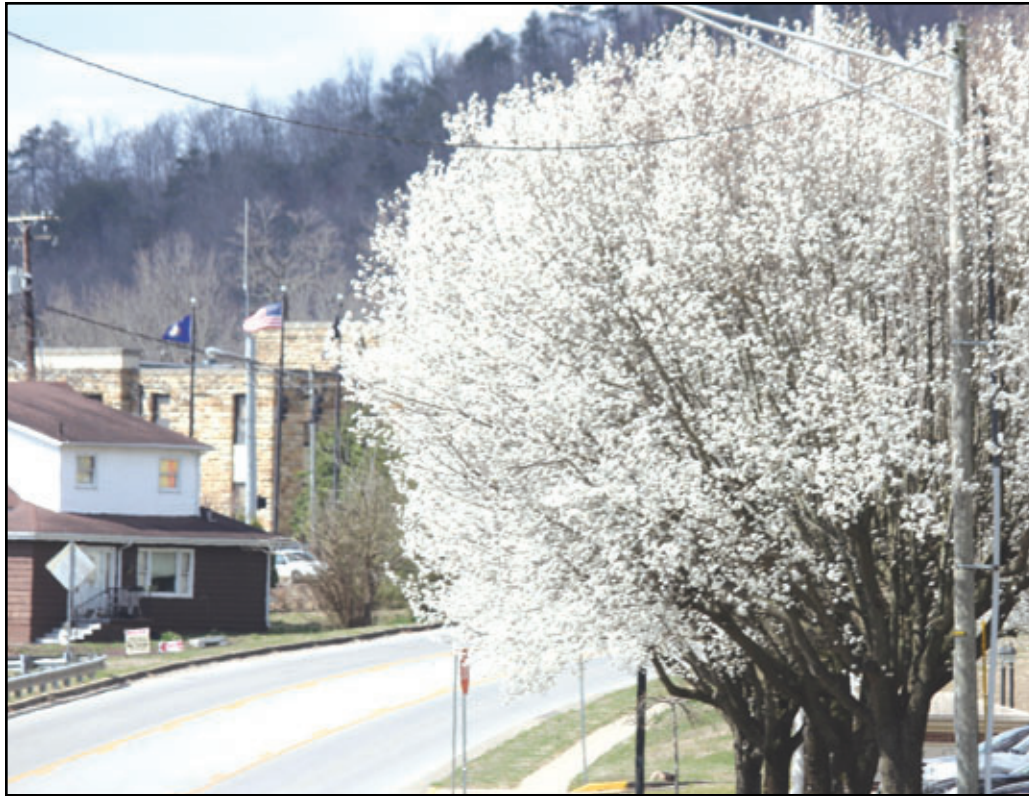
Blooming trees on River Drive announce the arrival of spring on Thursday, March 21. The Estill County Courthouse is seen in the background, along with a green space owned by the City of Irvine.